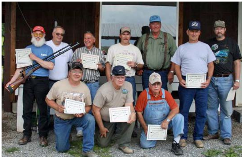
Ridgway Award Winners — July 2009

Remember to shoot straight, often and don't forget to involve the younger generation in our shooting sports.