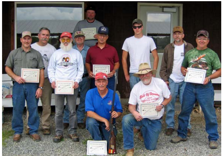
AWARD WINNERS AUGUST BPCR SILHOUETTE MATCH