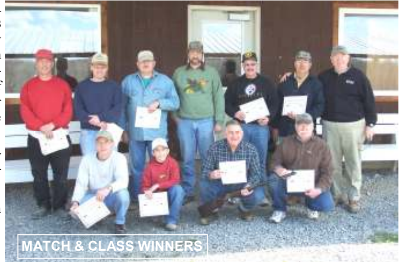
MATCH & CLASS WINNERS